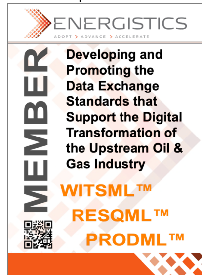
Large 6" x 9" banner For large display