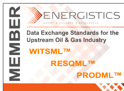
Energistics small badge 2" x 3" For small display