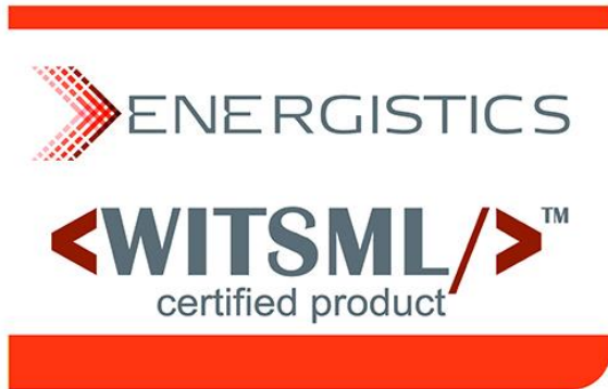
Figure 1. Energistics WITSML certified product logo.

If a server product passes all relevant automated tests based on the published capabilities of the server, then it is designated as WITSML certified by Energistics. Products that have been certified can use the following logo on their marketing materials and are listed on the Energistics website as a WITSML-certified product.